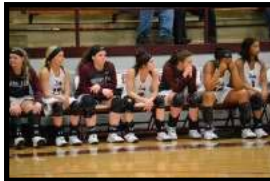
The Lady Devil Dogs watch their team.