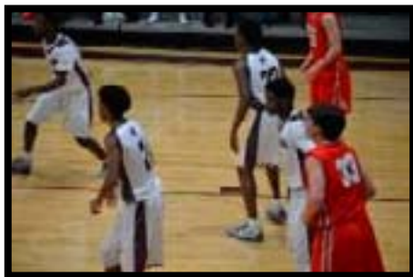
The Dogs in a tense game

In a stellar comeback season, the Lady Devil Dogs proved that they will be the future rulers of the conference with the next 2 years. Though they failed to make the playoffs, they certainly made their marks.