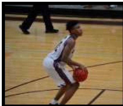
Jefferson prepares to shoot